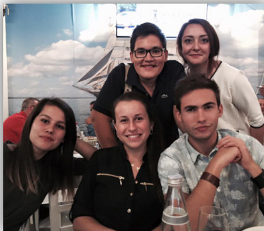
2015-2016 Fall Term - Welcome Dinner