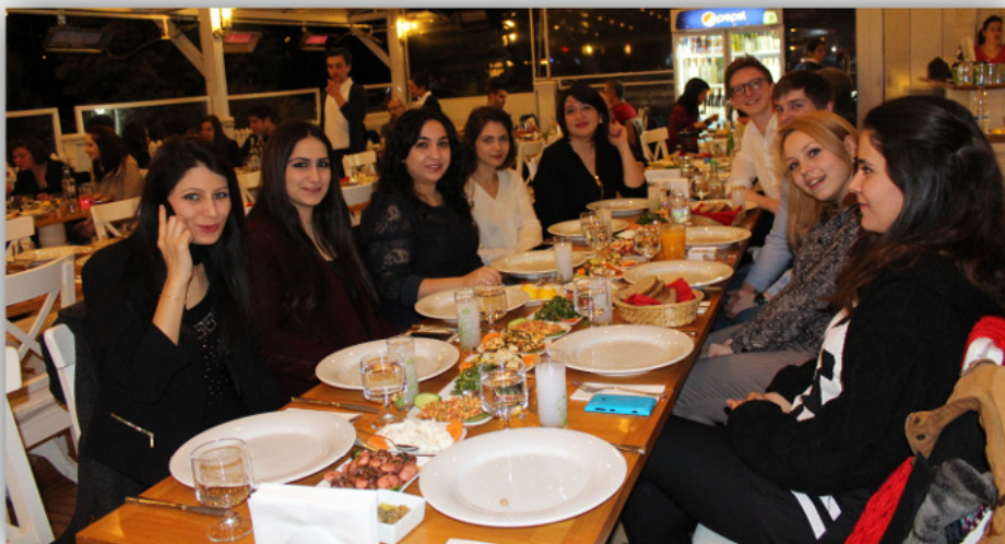
2014-2015 Spring Term - Welcome Dinner